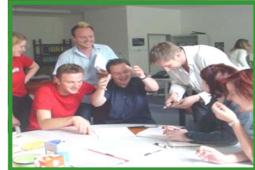
The aerospace process approach AS/EN9100:2009 + best-practice tools

“product conformity and on-time delivery performance must be measured and appropriate action must taken if planned results are not, or will not be, achieved” . Our innovative Implementation programme transforms basic AS/EN9100 conformance into a vibrant process-orientated AQMS.