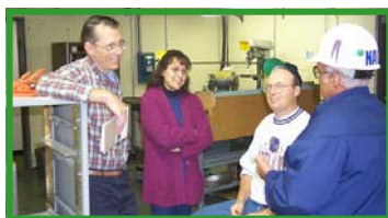
Remember that your customers can mandate AS/EN9100 certification!

We identify ‘skills gaps’ and assess the use of SC21 lean enterprise tools – then provide practical workshops and coaching to ensure competency. Included are topics System/Product Auditing and Nadcap process auditing ,